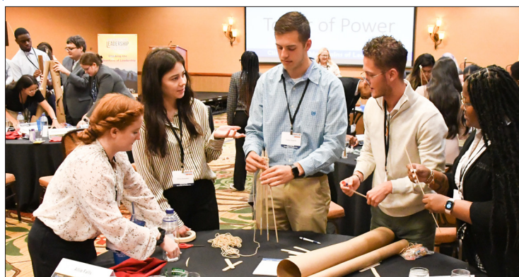
Students work together on team building exercise.