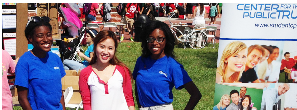
University of Louisiana at Lafayette

The StudentCPT Chapter at Southeast Missouri State University (SEMO) recently hosted an ethics simulation event on September 28, 2016. Students were divided amongst four groups and they were tasked with finding the best solutions to a proposed ethical dilemma. This meeting served as the first StudentCPT chapter meeting of the semester. New members were invited to learn more about the StudentCPT mission, chapter program and StudentCPT Leadership Conference.