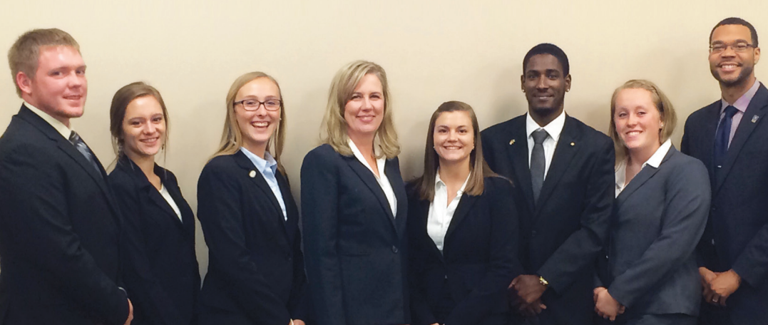
Colorado Mesa StudentCPT Chapter Kickoff