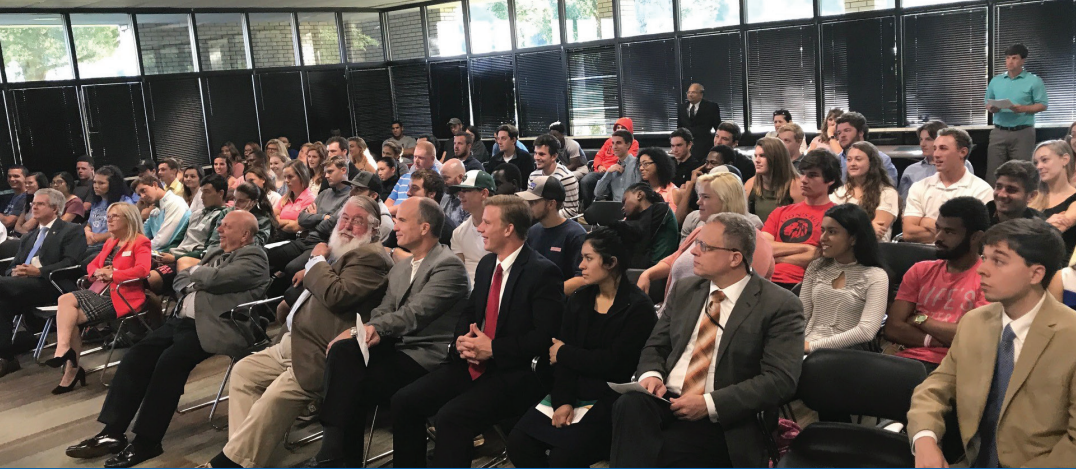
University of Mount Olive Chapter Kickoff