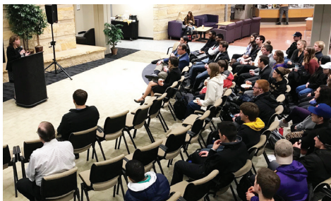
MNSU StudentCPT Chapter Kickoff

Minnesota State University, Mankato – November 6, 2017