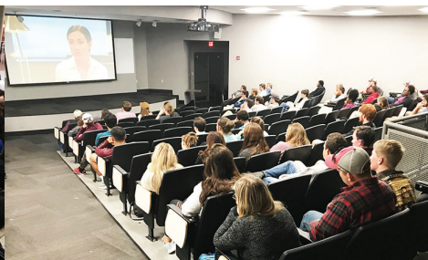
Mississippi State StudentCPT Chapter Kickoff