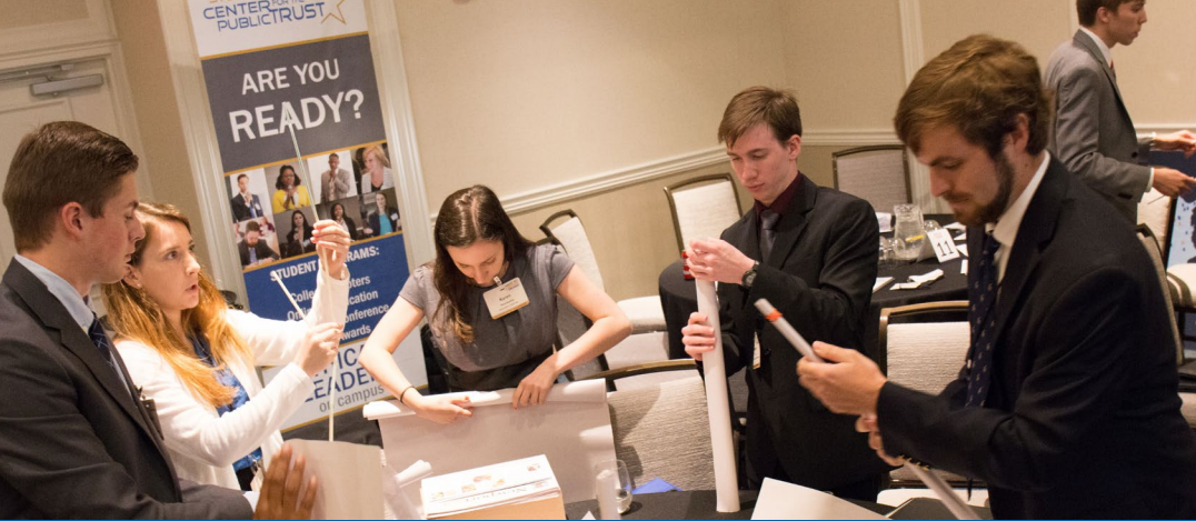
Students working at the SLC.